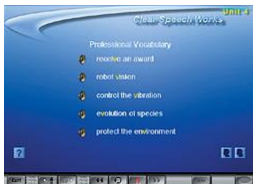
Listen, say and record words and sentences