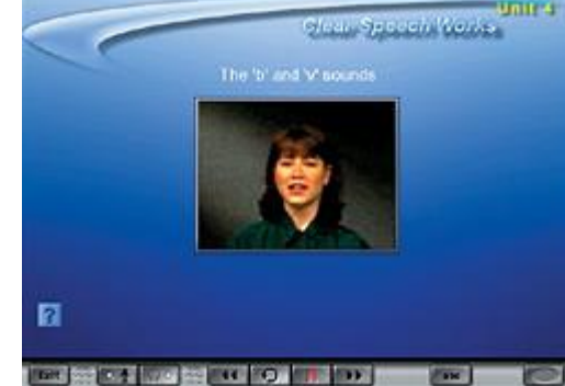
View video presentations