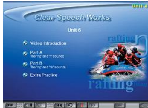
Select a Specific Area of Focus