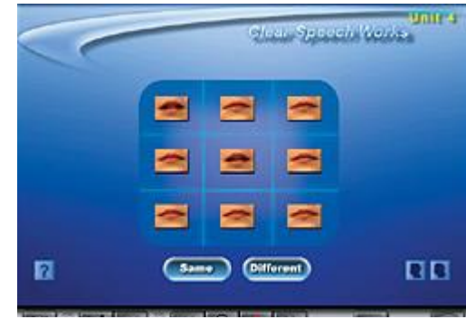
Hear the difference between sounds