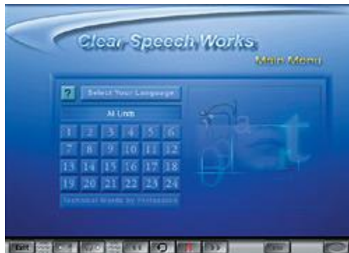
Select a Unit